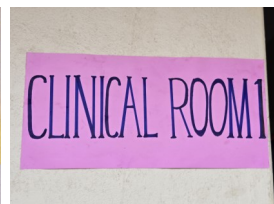
Top and middle left: Volunteer doctors treat patients at Shines Medical Camp